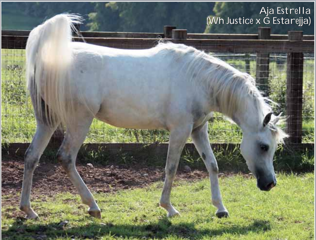
Aja Estrella (Wh Justice x G Estarejja)

European breeders do have competitive horses, and maybe would surprise themselves if they entered more shows, we all know the old saying “no pain, no gain”.