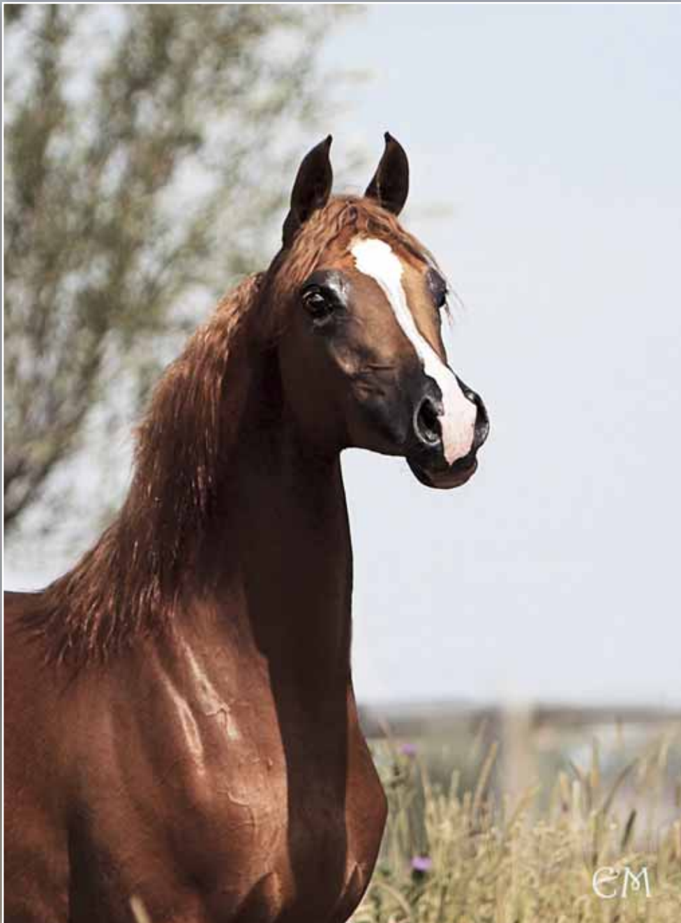
AJA ELECTRA (EDEN C x ELANDRA)