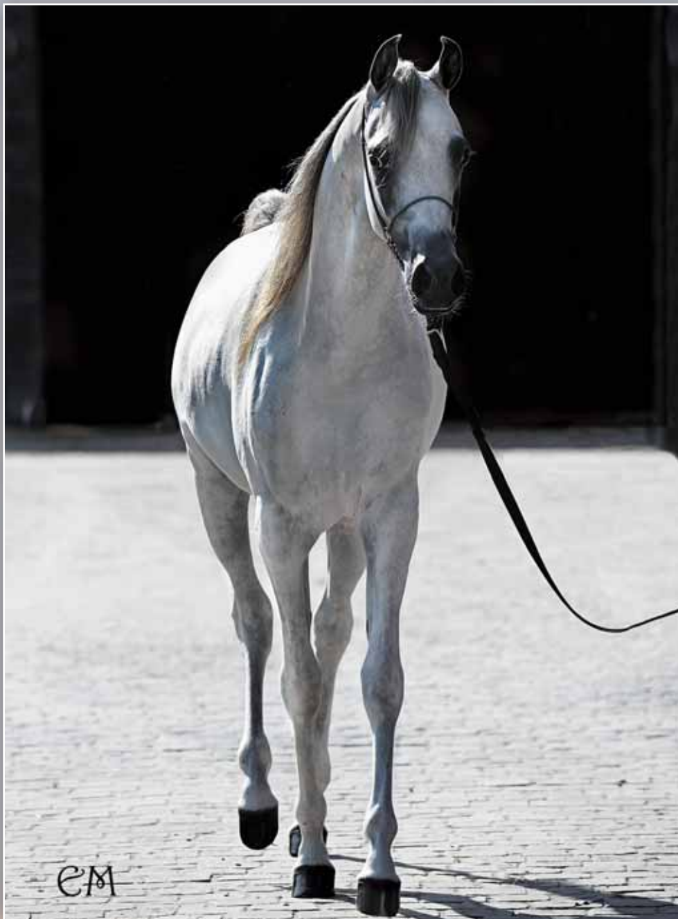
AJA ANGELO (WH JUSTICE X AJA AAISHA)

was not achievable in one cross, and over generations we have gradually began to achieve our goals, adding bit by bit the desirable characteristics, and trying to breed away from the less desirable, we are definitely on our way to achieving the "Aja look". This we believe makes an Aja horse unique and therefore desirable to other breeders, the upside for new owners of course is the genetic pre potency, which in turn makes them ideal future breeding stock.