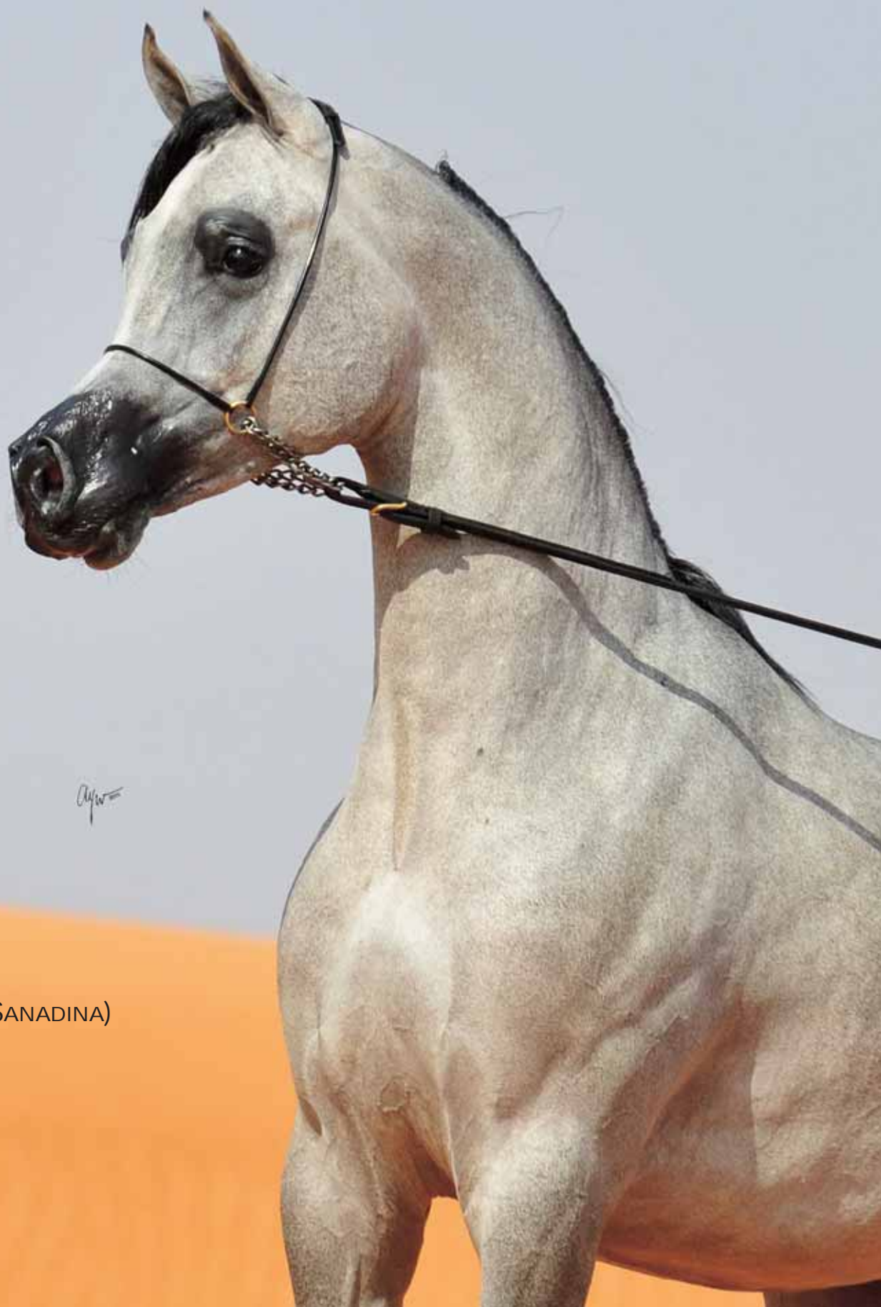
AJA ADONIS (VH JUSTICE X SANADINA)